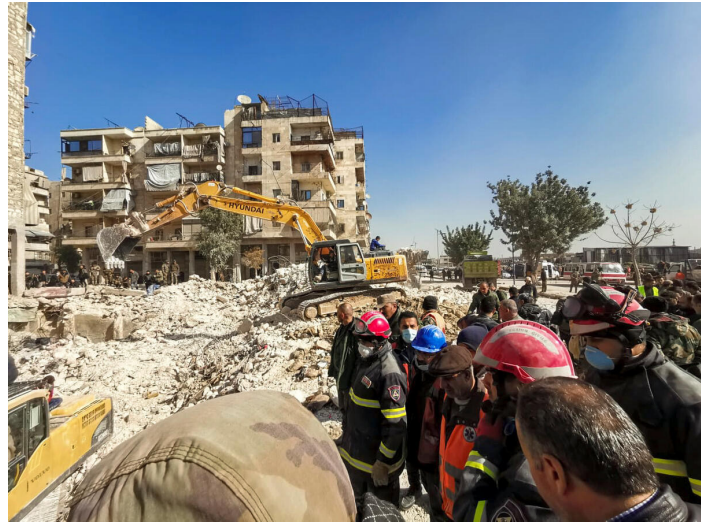
Residents and rescuers search for victims and survivors amidst the rubble of collapsed buildings following an earthquake in Aleppo.