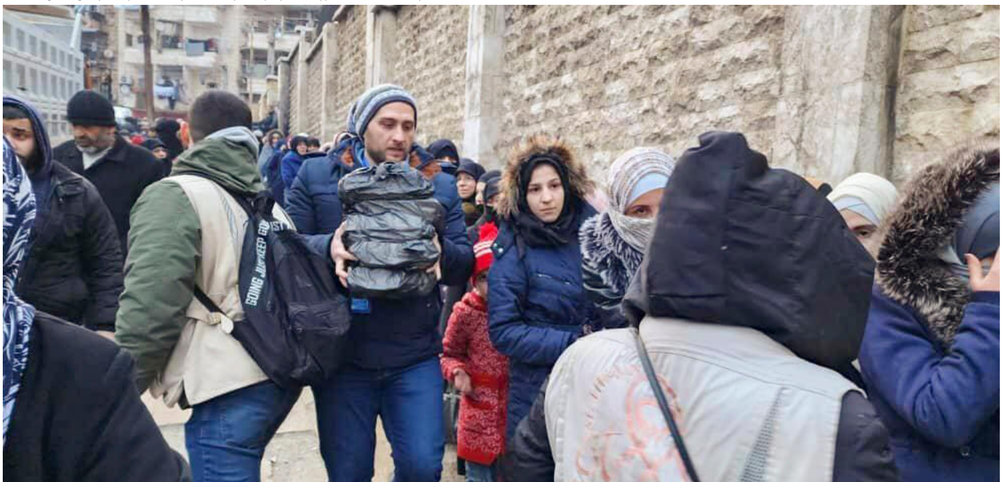
Distributing emergency food purchased by WFP to displaced people in Aleppo.