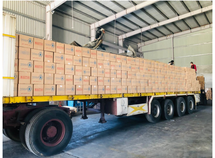
1500 RTEs on the way to coastal area in Syria on the 11th of February