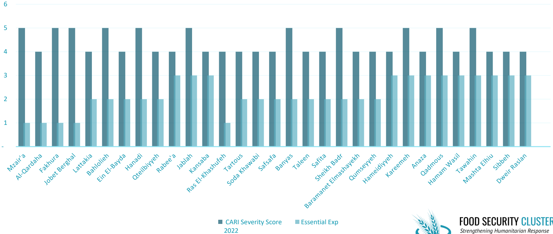
CARI Vs EES