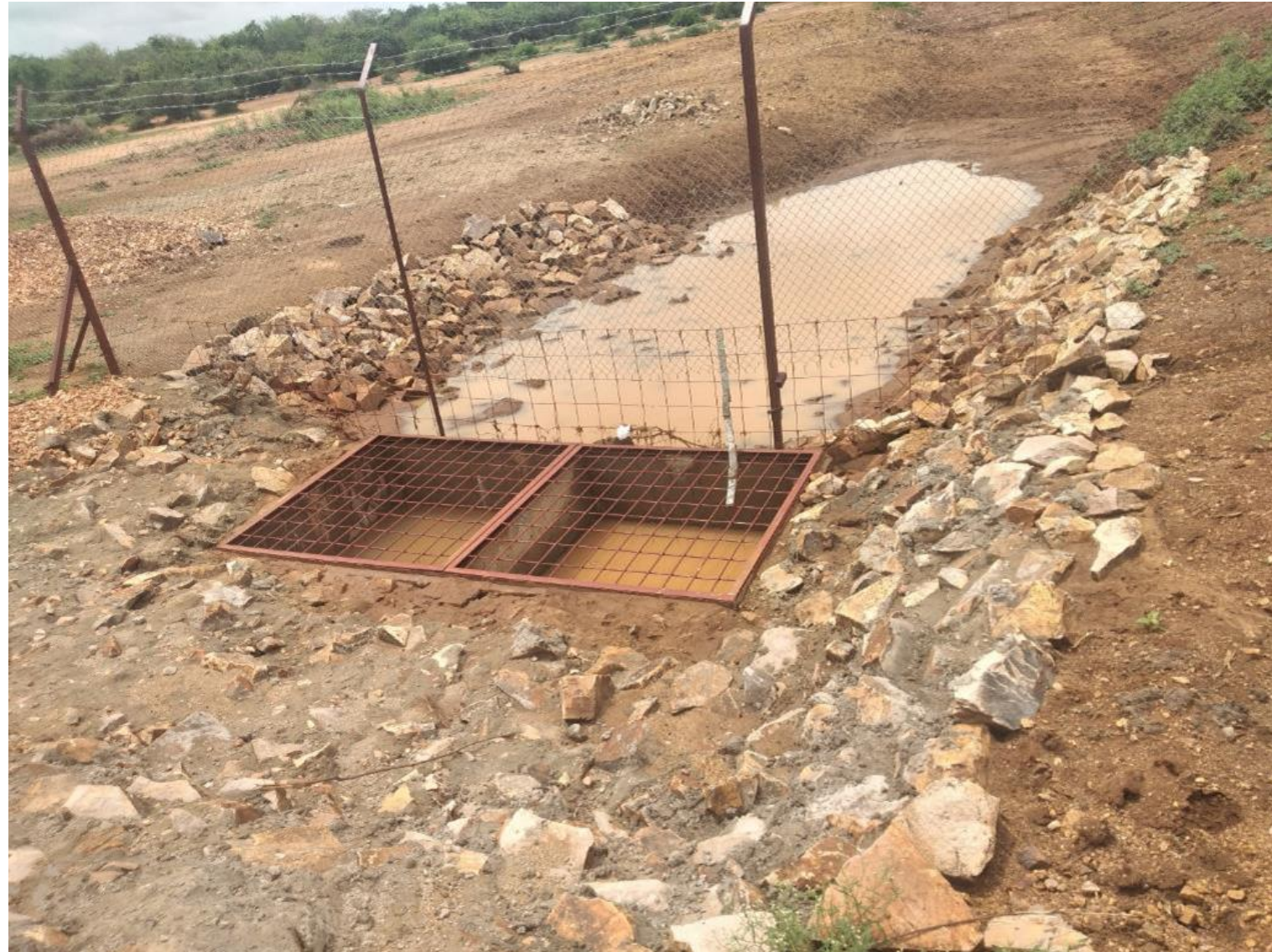
Nakerengeme hafir, Kapoeta South County, new water inlet boxes and silt trap basin