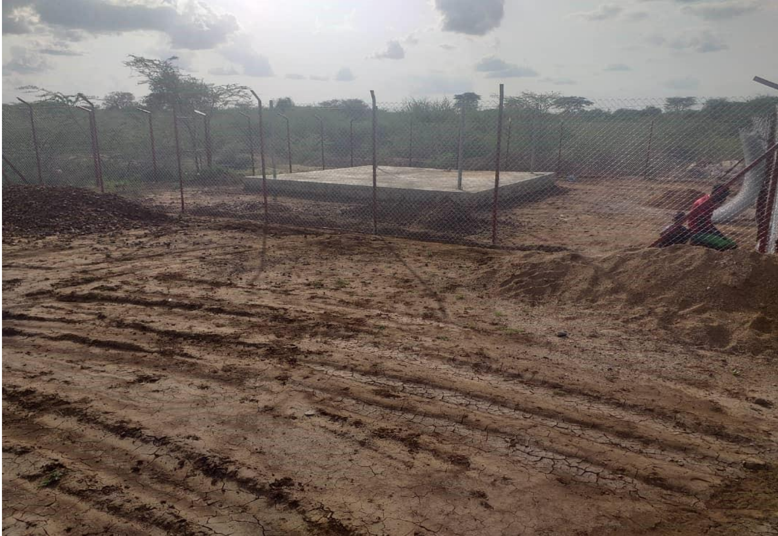
Construction of a slaughter slab in Kapoeta East County