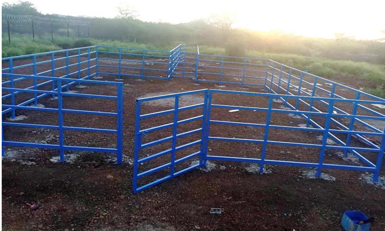
Crush for livestock vaccination