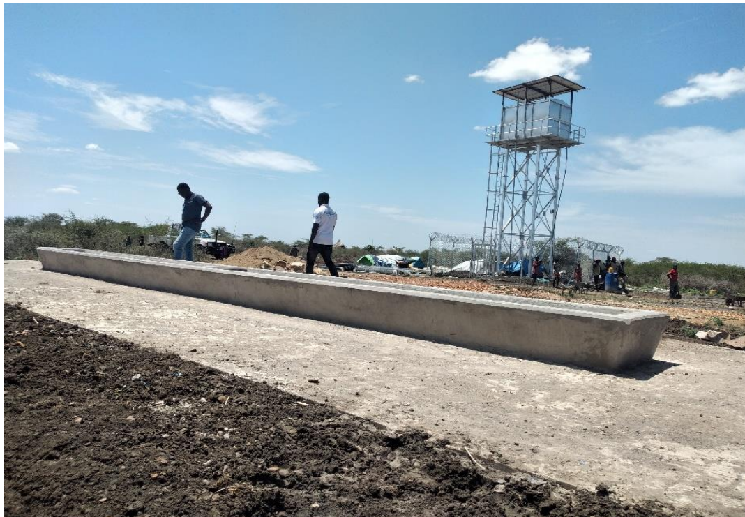
Water trough for livestock