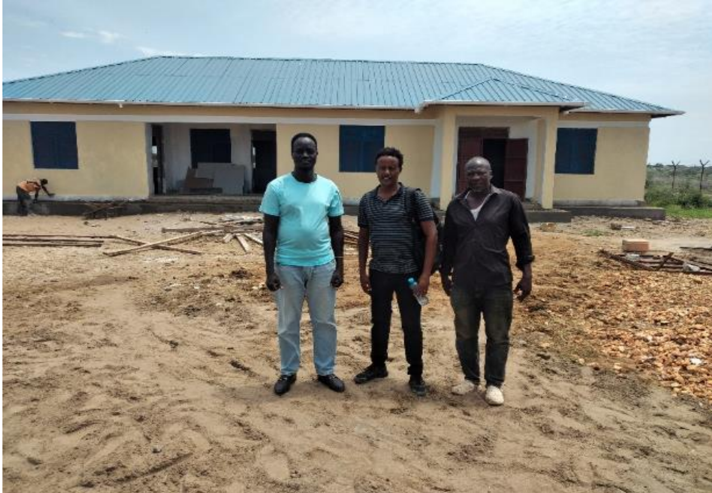
Construction of a Veterinary clinic in Kapoeta South County