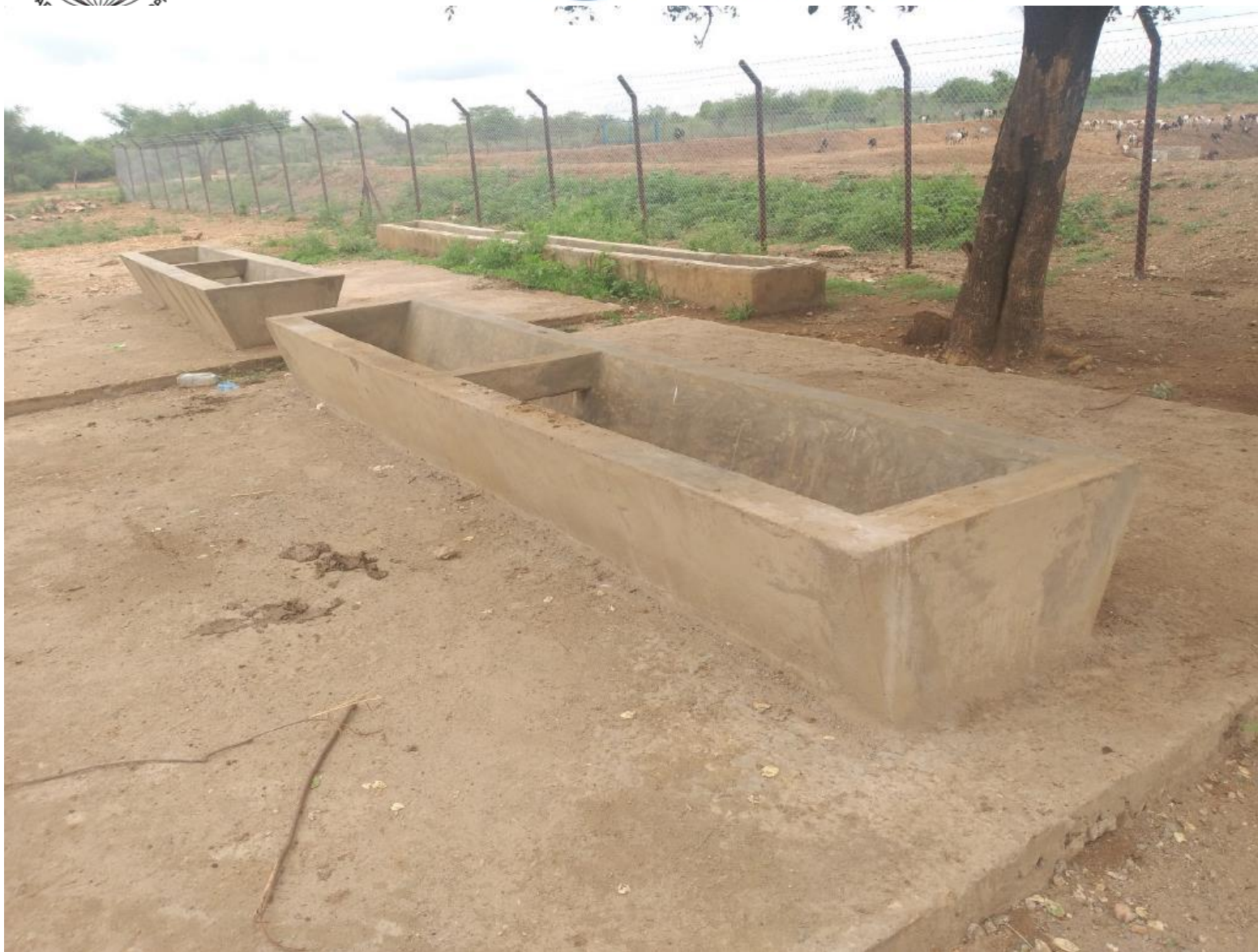
Nakerongeme hafir, Kapoeta South County, livestock troughs