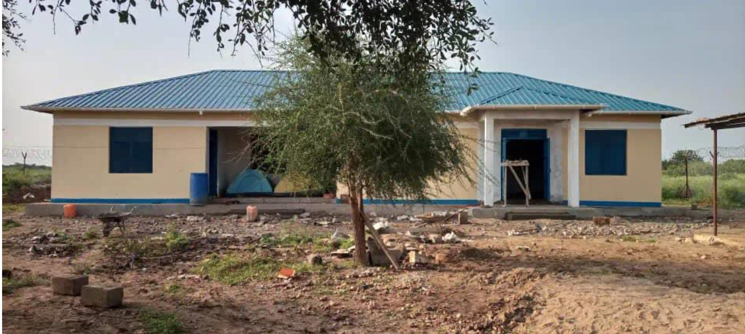
Construction of a Veterinary clinic in Kapoeta North County