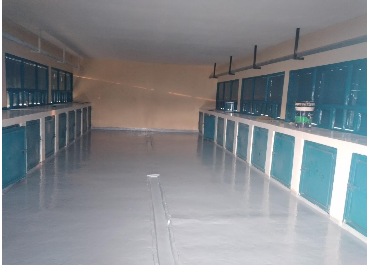
Construction of a meat market in Kapoeta town