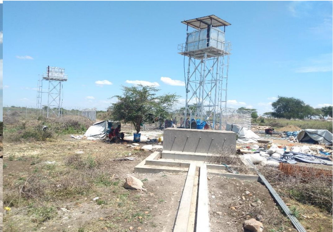
Domestic water trough