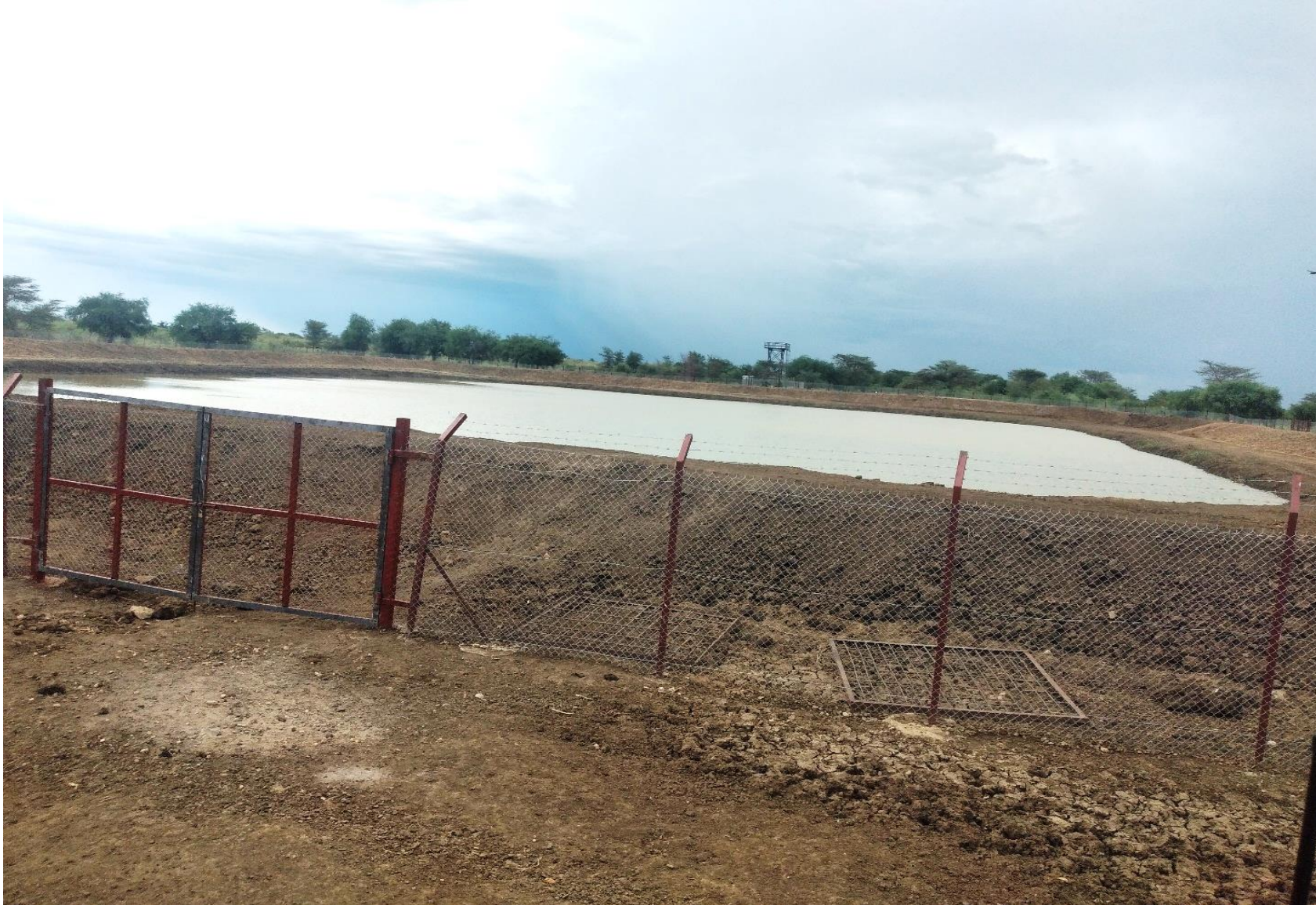
Lokogges hafir, Wokobu payam, Kapoeta North