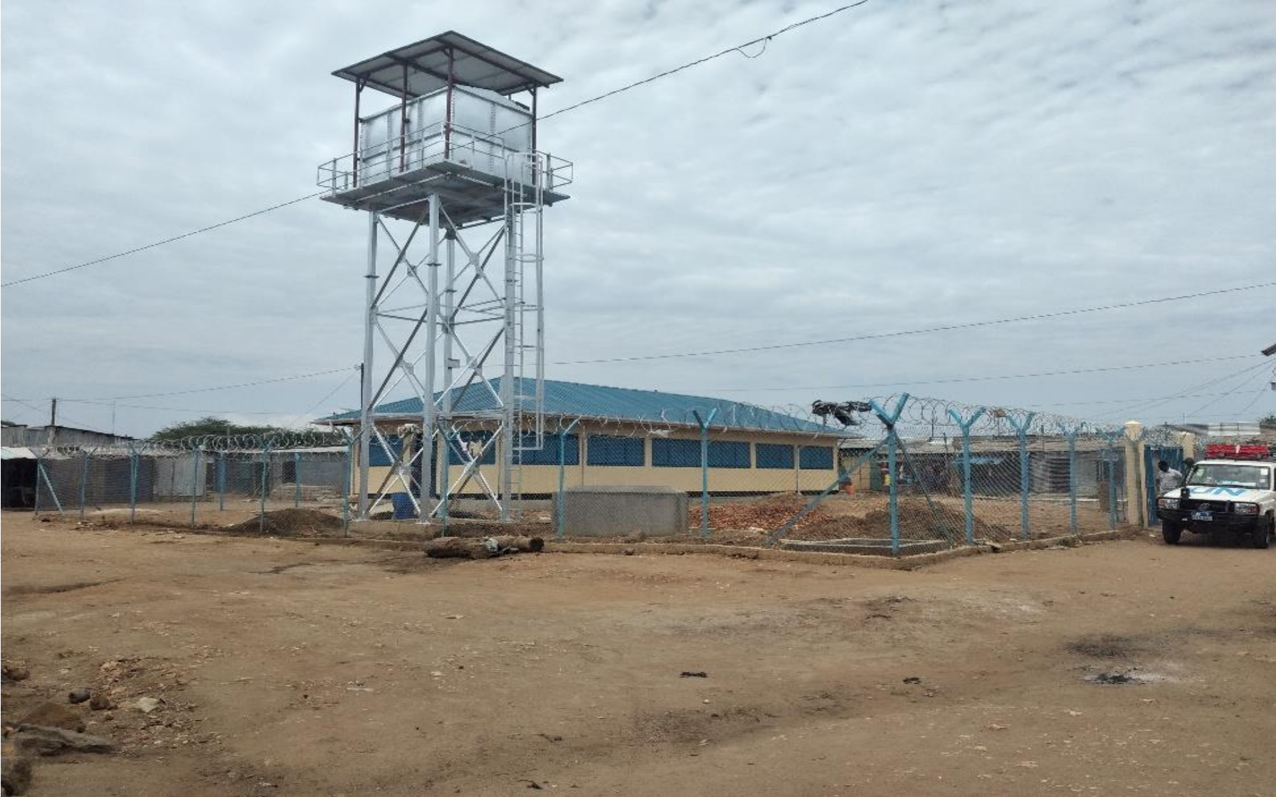
Construction of a meat market in Kapoeta town