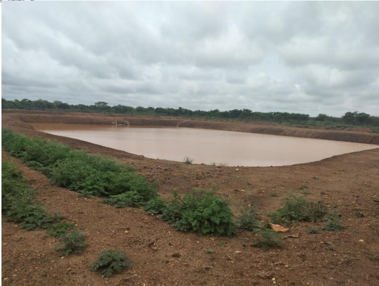
Nakerongeme hafir, Kapoeta South County