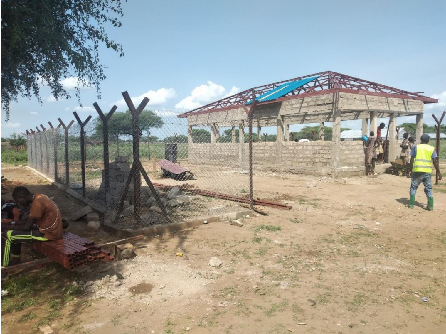
Construction of a meat market in Kapoeta North County