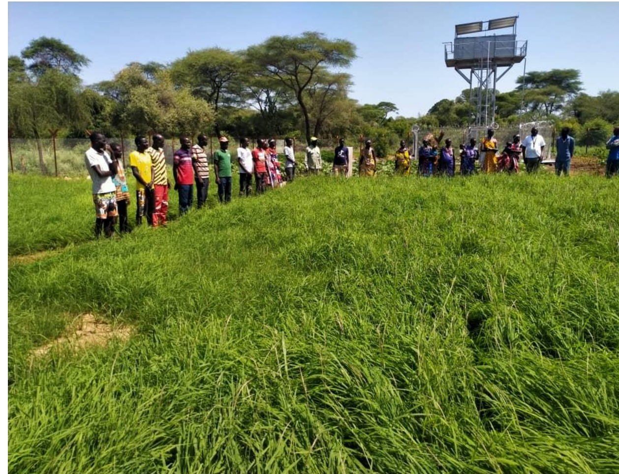
Training in improved fodder production – Kapoeta South County