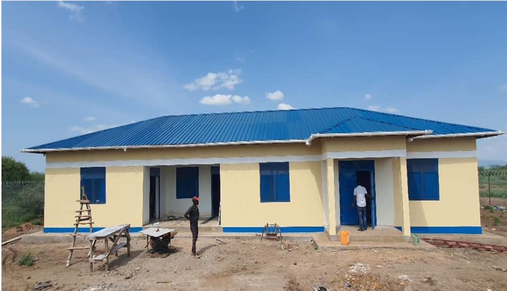
Construction of a Veterinary clinic in Kapoeta East County