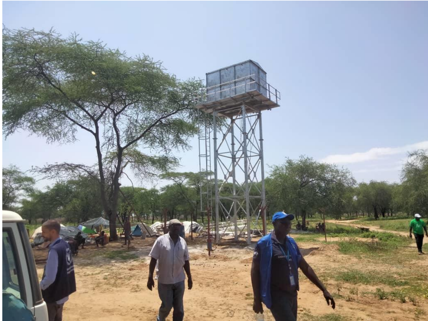
Multi purpose solar powered borehole in Lemeyan payam, Kapoeta North County