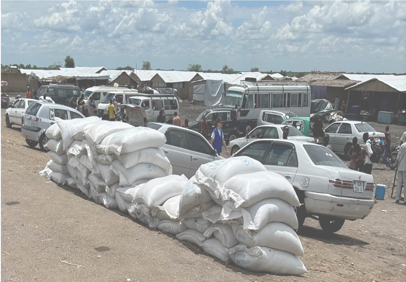
Renk, Sep 2023