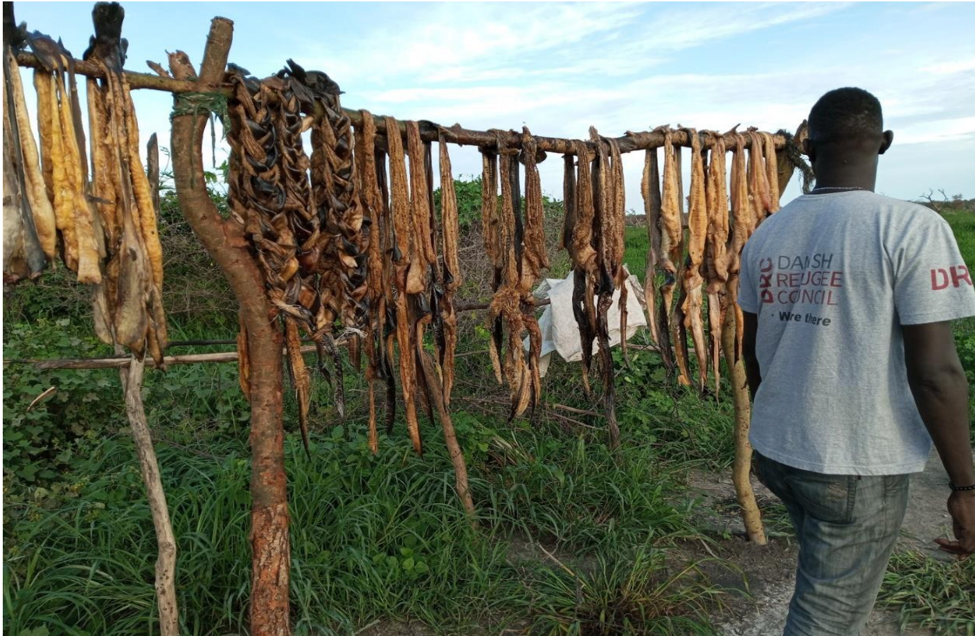
Fishermen drying fish in Longwundit, Kurwai Payam, Canal-Pigi, Photo credit: Danish Refugee Council