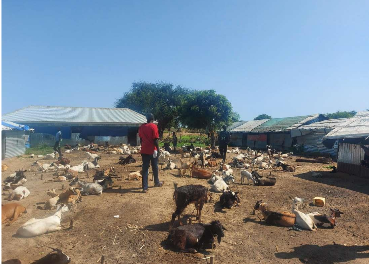
Cattle camp, Bor South