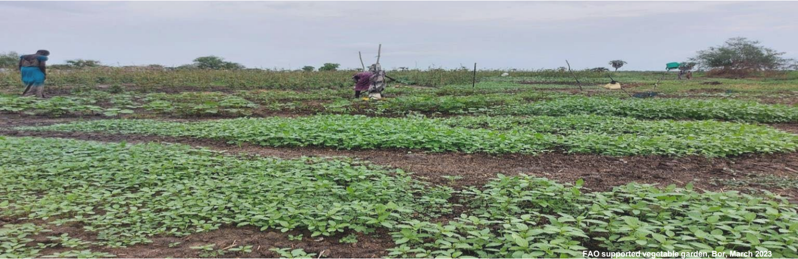
FAO supported vegetable garden, Bor, March 2023

HRP 2023 figures: 8.3* M People in Need | 6.0** M Targeted | $650 M Requirement (35.7% Funded) * Including Abyei and Refugees Populations ** Excluding 0.3 M Refugees As of April 05, 2023