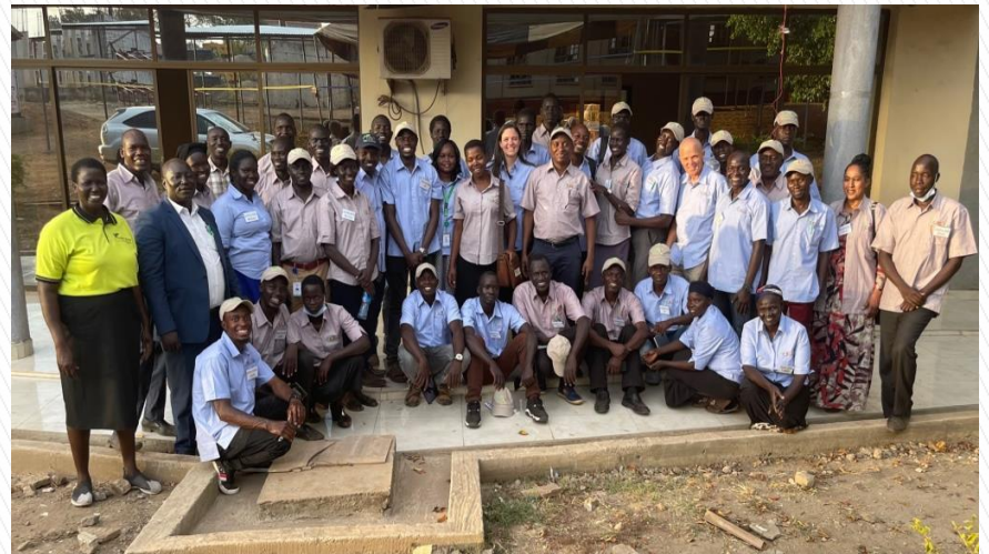
TOT training for FARM STEW staff