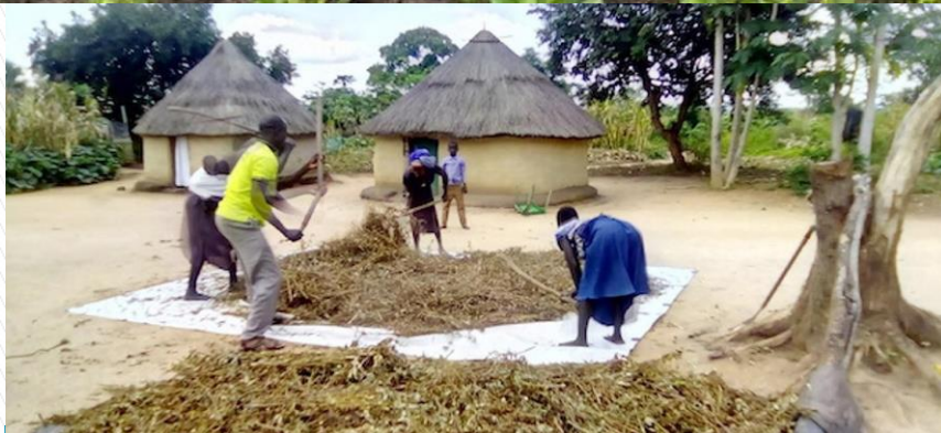
Threshing of soy bean