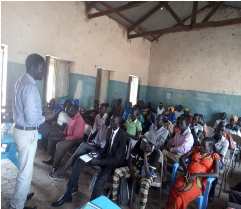
Community initiative for self-reliant training