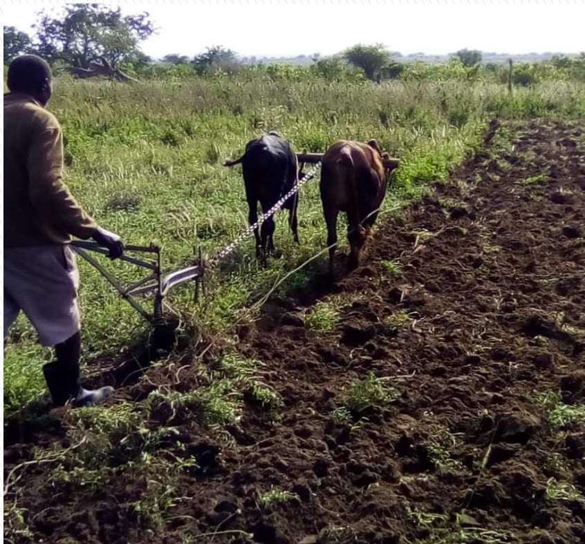
Trained oxen are cultivating the farmer's garden