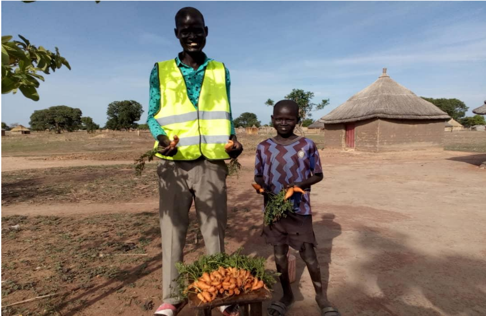
Volunteer displaying Carrot harvested from his farm in Tonj South, Warap State