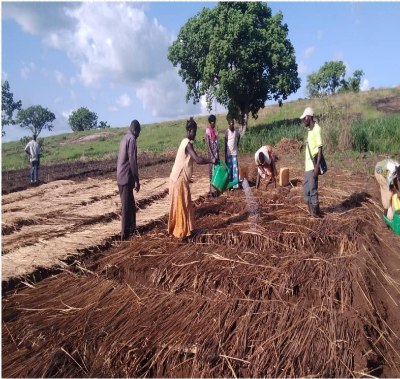
Vegetable group watering their nursery bed under supervision of the volunteer