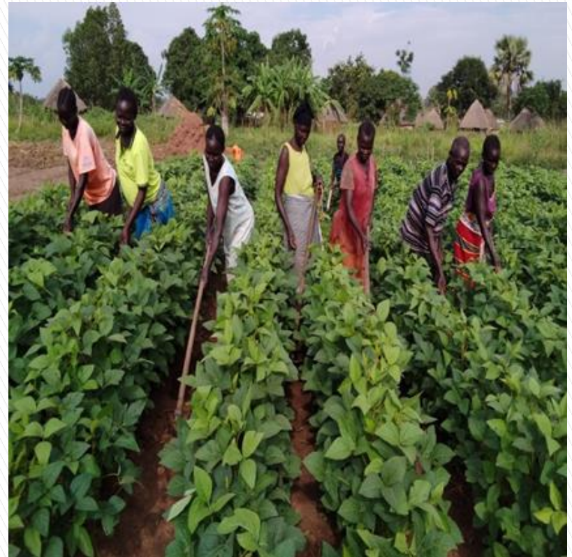
Farmers group weeding their soy bean garden