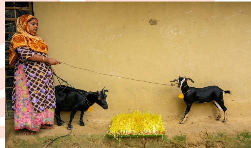
PROVISION OF LIVESTOCK KITS