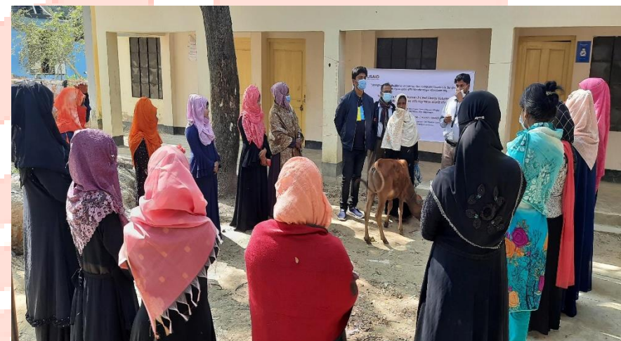
AWARENESS SESSION ON LIVESTOCK DISEASES AND WAHV