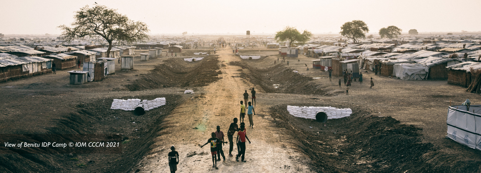
View of Benitu IDP Camp