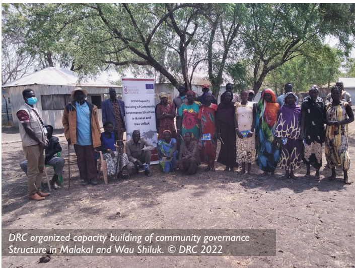
DRC organized capacity building of community governance Structure in Malakal and Wau Shiluk.