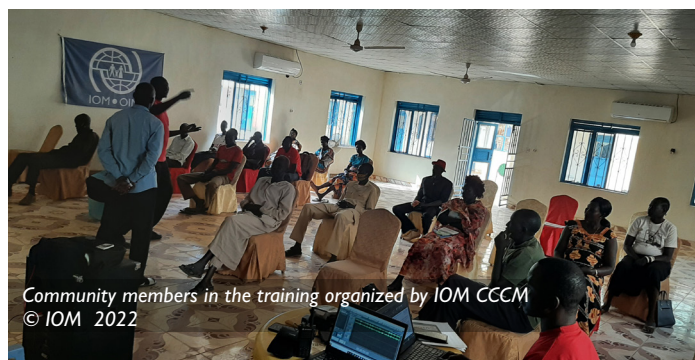
Community members in the training organized by IOM CCCM