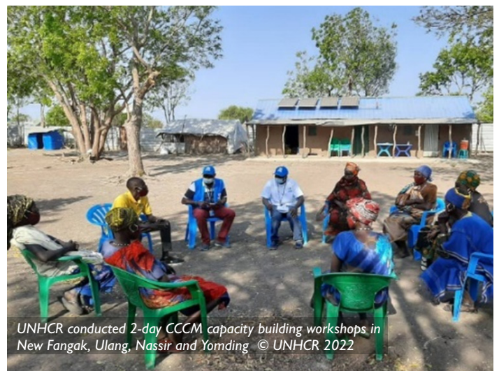
UNHCR conducted 2-day CCCM capacity building workshops in New Fangak, Ulang, Nassir and Yomding