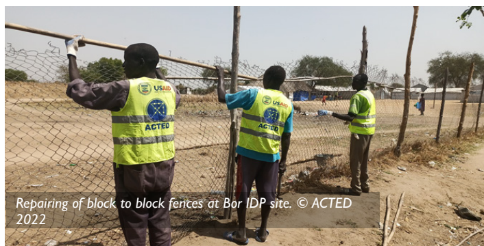
Repairing of block to block fences at Bor IDP site.