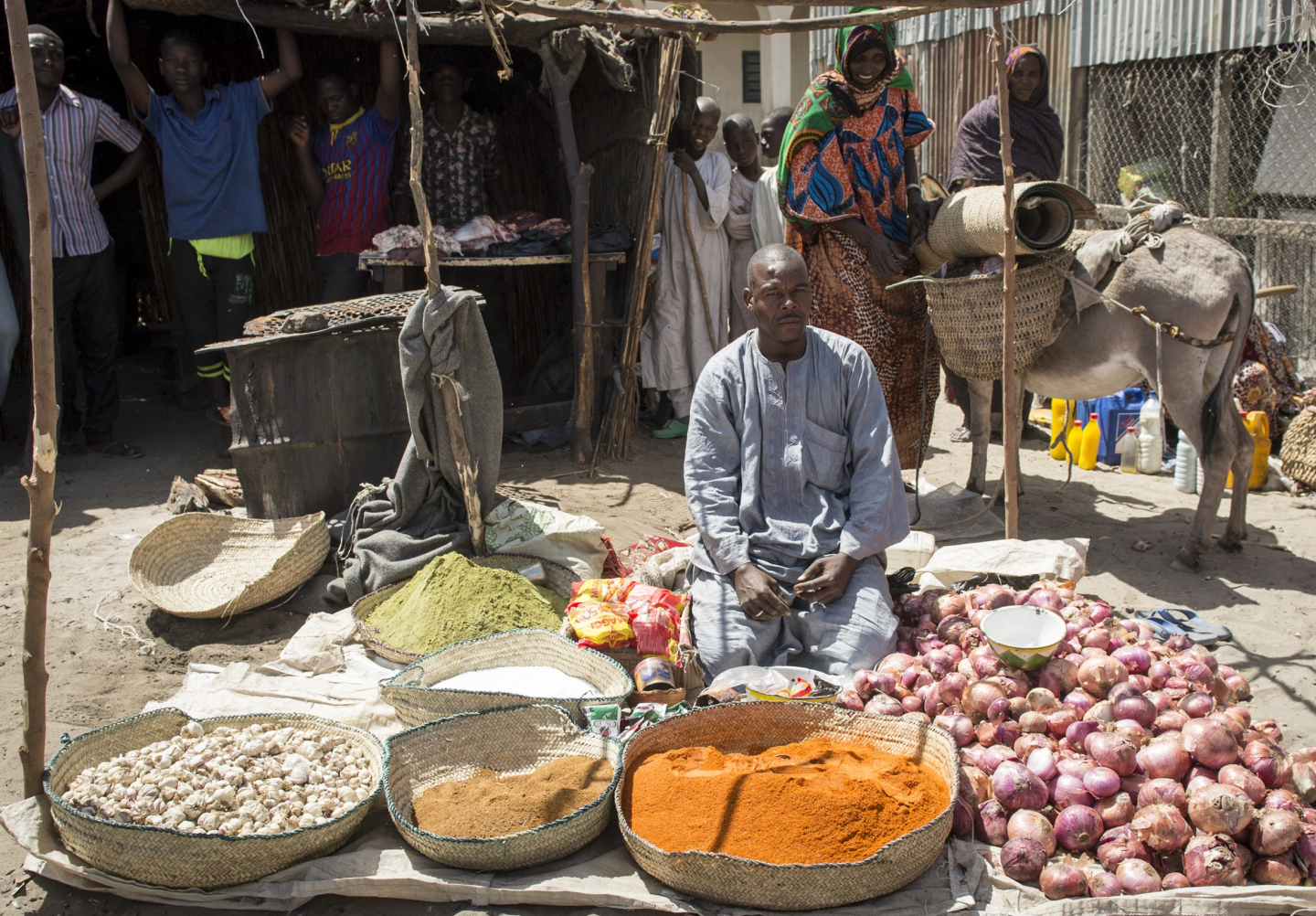
Food Security Cluster Global Partners Meeting