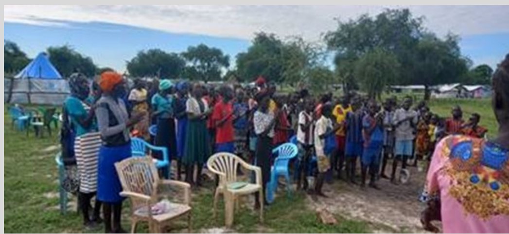
Photos: Back-to-school campaign in Walgak, Akobo West