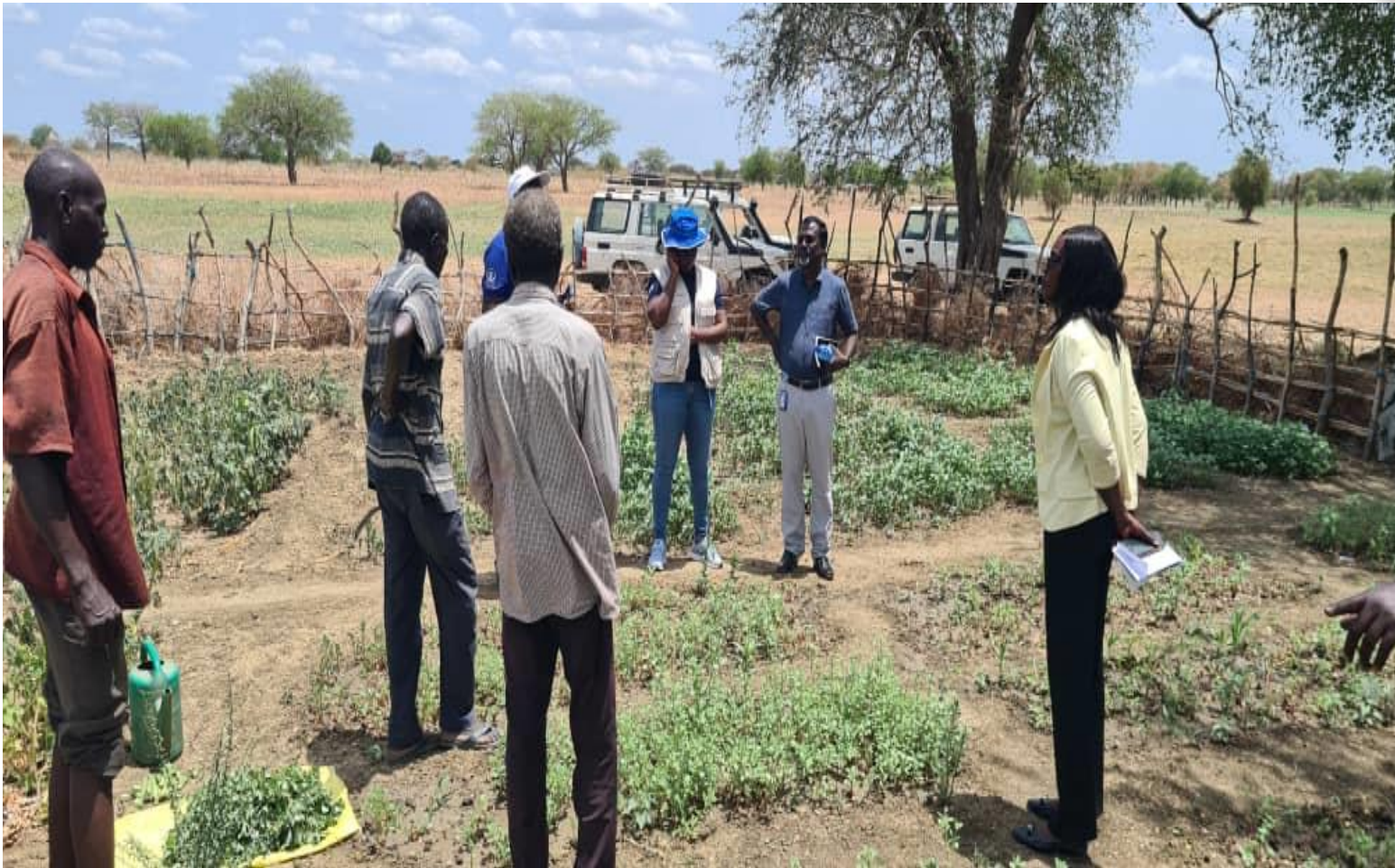
WFP / FFA Vegetable Garden of Women Group Abyei Administrative Area