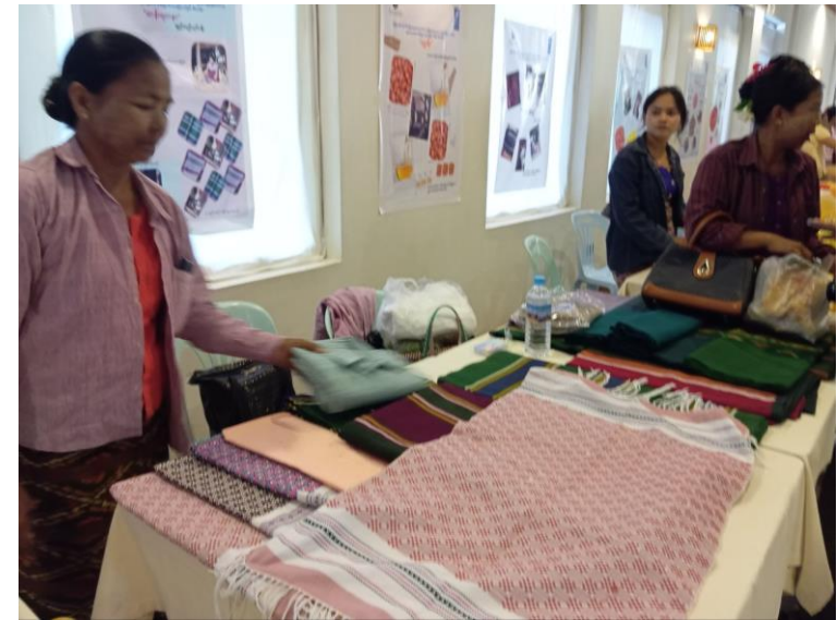
Organizing the Exhibition and Showcase for the Products