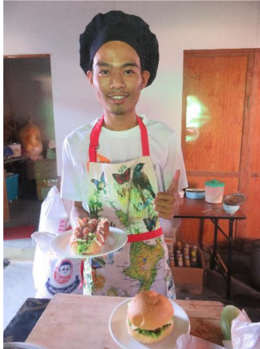
Job Creation for Youth