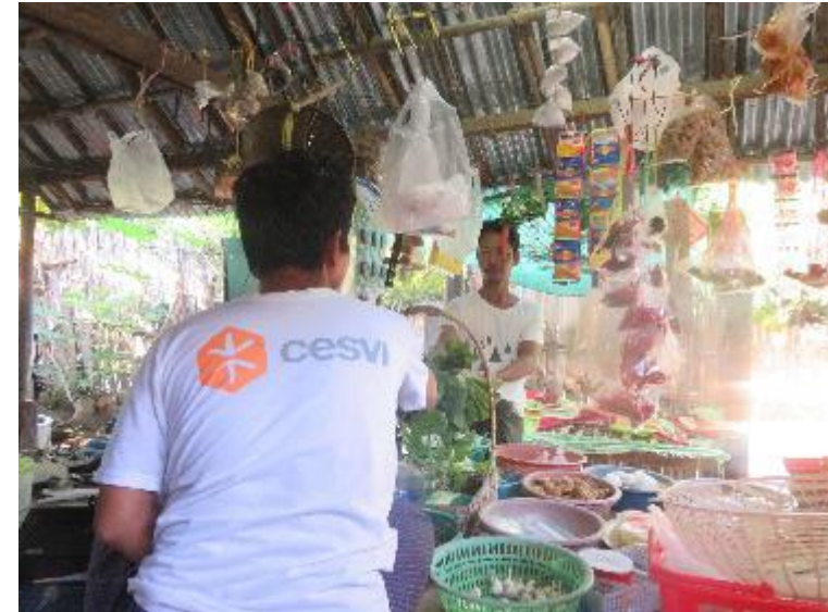
Income Generation Activity after provision with small grants